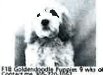
F18 Goldenoodle Puppies 9 wks old. Contact me 305-720-1092