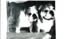
ENGLISH BULLDOG 1 yr AKC CUP Bld. crate & potty trn. get whisk & animals. sweet boy! $1,600. 954-600-6050

Certified Show Chihuahua Breeder, www.hollywoodchis.com , 617-314-0523 info@hollywoodchis.com